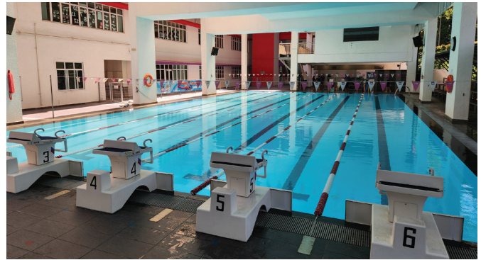
Diagonal angle view of the indoor six-lane swimming pool