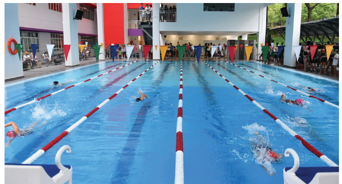
The swimming pool is regularly used for sporting events, lessons and activities, nurturing the interests and potentials of young learners (Source from Desa ParkCity Kuala Lumpur Official Website)