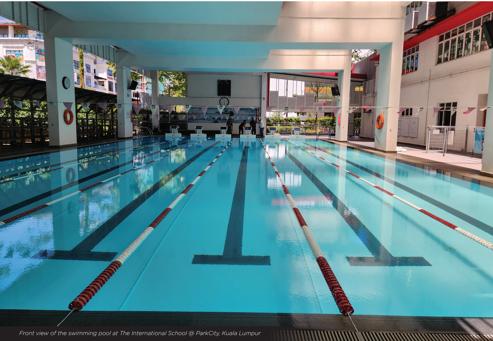
Front view of the swimming pool at The International School @ ParkCity, Kuala Lumpur

Waterco Far East Swimming Pool Kuala Lumpur, Malaysia