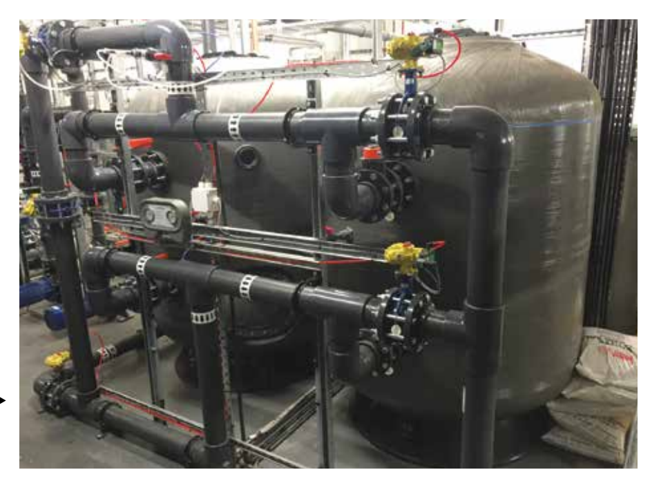
Waterco's Dual Pressure gauge panel extremely versatile pressure measurement and test instrument. It can simultaneously display the output of two pressure gauges, so that you can accurately monitor the filter's pressure drop.

All filters were fitted with the Waterco dual pressure gauge panels to indicate the differential pressure readings across the filter bed for backwashing purposes. The backwash system is fully automatic with a mimic showing the action of all the valve processes for filter, backwash and filter to waste (rinse) facilities.