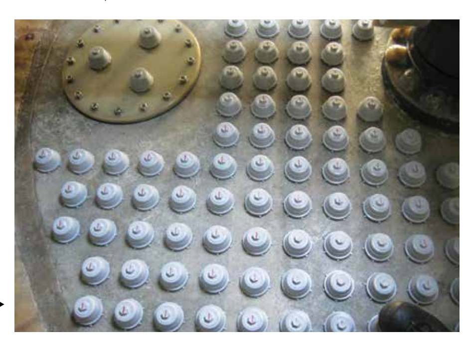
Waterco's patented method of fabricating a noz plate filter practically eliminates failure rates experienced in most other nozzle plate filters.

SPDD nozzle plate filters were used over the more conventional lateral commercial filters in order to produce a better standard of fluidisation and sanitisation.