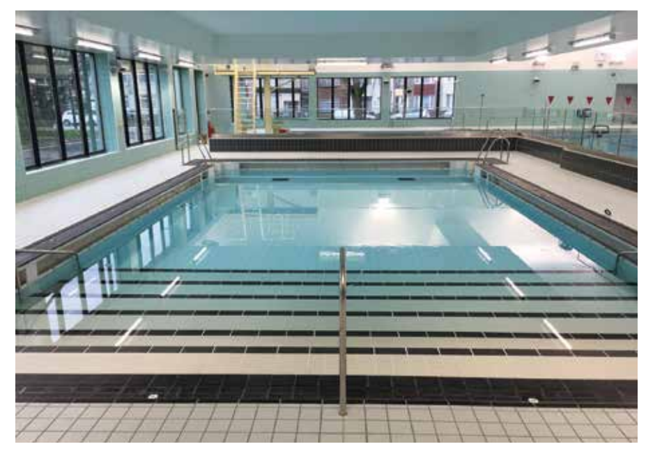
60m3 fully tiled teaching pool.

Behind the scenes, an equally impressive works project got underway. "The original filters were two horizontal and one vertical metal fabricated sand filters that had started to corrode and were costly to repair, along with the ongoing maintenance program required with metal fabricated filters," Mr Cheek states.