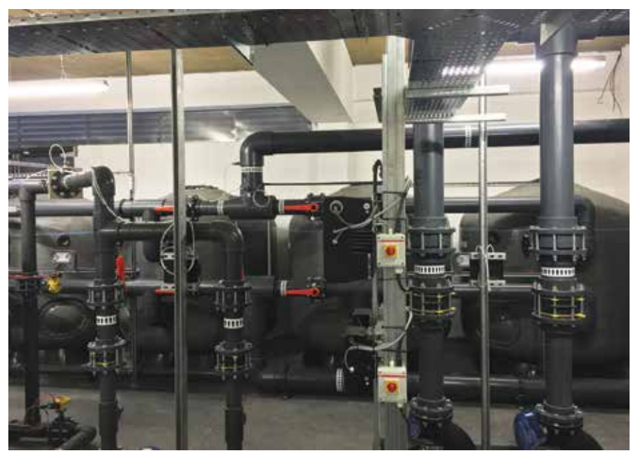
Waterco's Micron SPDD Nozzle Plate filters are made from continuous strands of high quality fibreglass filament wound under controlled tension to create a seamless, impervious filter vessel.

turned to Waterco, which supplied four Micron SPDD2000 Nozzle Plate filters for the main pool and two Micron SPDD1400 for the teaching pool. Waterco's EcoPure Glass Media was used for both filters, while Waterco Dual pressure gauge panels were also installed.