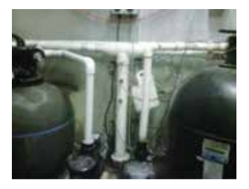
Ageing filtration system installed in

In addition, the pool's plant room door only measured 800mm wide, thus limiting the options for a larger sized commercial filter. The existing filtration plant consisted of two 750mm diameter sand filters plumbed with 40mm pipe to two, two horse power pumps.