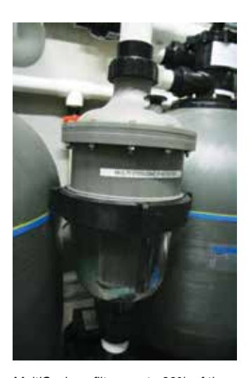
MultiCyclone filters up to 80% of the pool's dirt load before it reaches the pool filter.

For health-conscious travellers, the Shangri-La Hotel, Sydney offers a Health Club with a fully equipped gymnasium, indoor lap swimming pool, jacuzzi and sundeck.