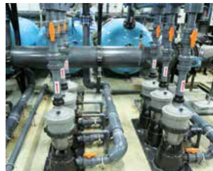
MultiCyclone centrifugal pre-filters working seamlessly with Lacron horizontal filters.

Taking into consideration the club's needs, Waterco and "Those Pool Guys" suggested a combined solution – Lacron 42" horizontal filters, Waterco MultiCyclones, plus Waterco Glass Pearls to replace the existing sand filtration media.