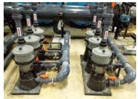
18 MultiCyclones are installed to minimise filter maintenance and save water.