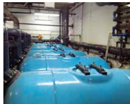
Lacron 42" horizontal filters filled with Waterco Glass Pearls.