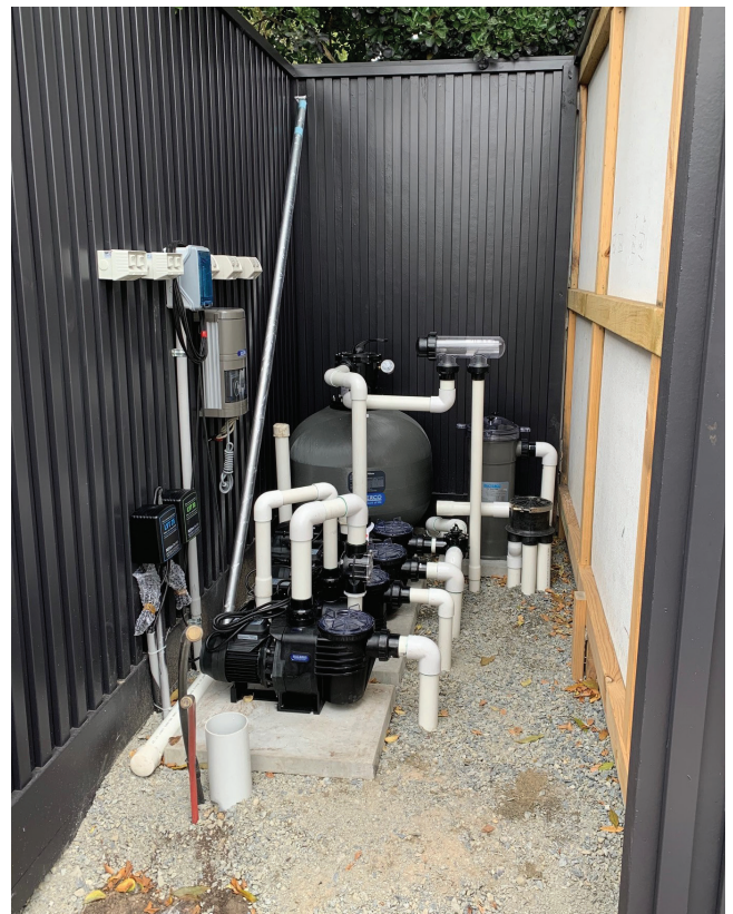
Waterco’s Hydrostorm ECO-V variable 1.5hp for the filtration, Hydrostorm 1.5hp for the in-floor and a Supatuf ECO 1.0hp for the spillway.

“My requirements were a competent in-floor system that suited the heavily treed area,” Glover explains. “This pool also has a spillway tank that required a separate circulation system. Darrin suggested suitable pumps — Waterco’s Hydrostorm ECO-V variable 1.5hp for the filtration, Hydrostorm 1.5hp for the in-floor and a Supatuf ECO 1.0hp for the spillway — to achieve the desired result.”