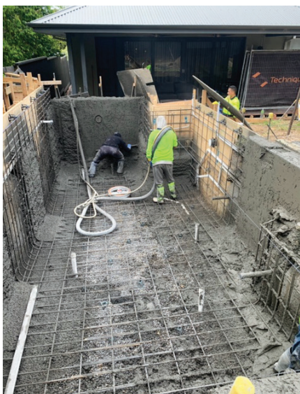
The process of installing an in-floor pool cleaning system with Waterco is easy — simply send in your plans and Waterco will work out the layout of the jets and the drain.