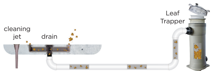
The revolutionary circular channel provides maximum flow and efficiently removes debris. Use in conjunction with the Blue Square In-floor System and Waterco Leaf Trapper to maximize performance!