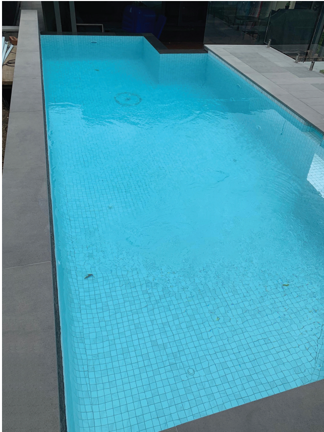
Waterco's cleaning solution automatically cleans the entire pool even while you swim. The in-floor jets and drain are virtually invisible on the pool floor.