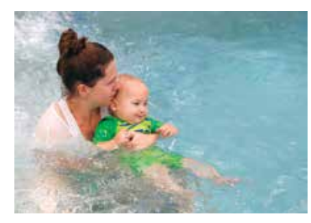
"One of the joys I get from my work is seeing the mums, dads and grandparents spending one-on-one time with their young children and grandchildren"