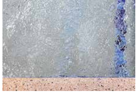
"The ozone that's coming into the pool produces tiny bubbles, and the kids are fascinated with the texture of the water and how soft it makes their skin feel,"