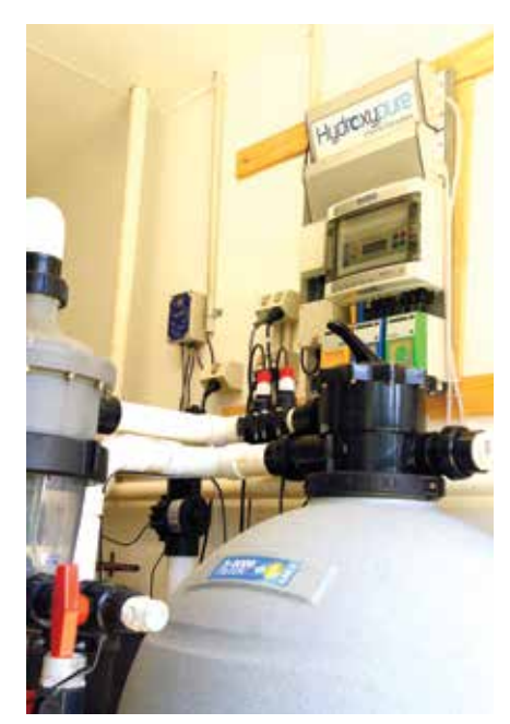
The Hydroxypure system continually sanitises your swimming pool by testing the water and automatically maintaining optimum levels of residual sanitiser.