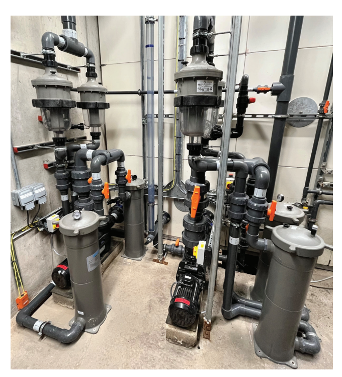
2 x C75 bag filters and double manifold MC16 centrifugal filtration units.

<u>One Tower Bridge London, Riverlight on the River</u> <u>Thames</u> and <u>Canada Gardens</u> are just a few projects that showcase the combined technical expertise and engineering excellence behind this well-respected partnership.