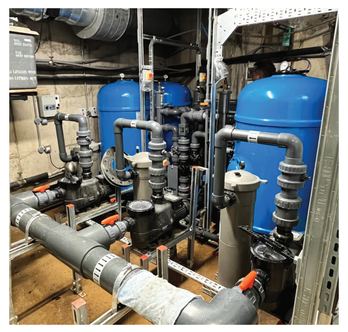
Hydrostorm Plus pumps and C75 Trimline bag filters ensure it is filtered to the very highest quality.