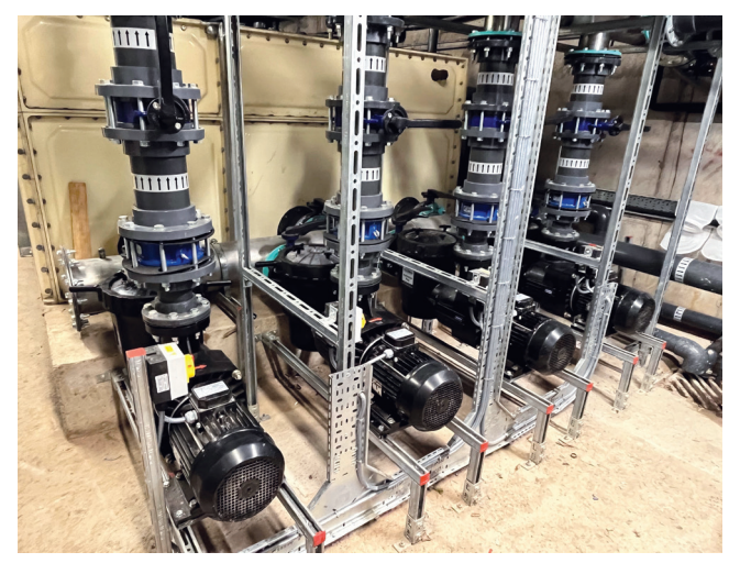
Four Waterco Hydrostar Plus pumps draw water from the main reservoir and back to the feature.