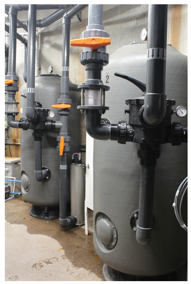
Micron SMDD900 commercial media filters and re-entering the feature via the main reservoir.