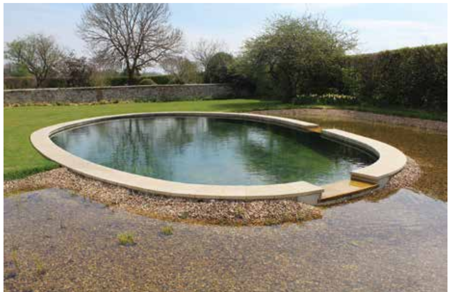
▲ 40m 3 Natural pool, featuring a dual spill over into the gravel filtration bed, which in turn was planted with a variety of water plants.

"This will help reduce the interval at which sediment is laid down and does seem to reduce the formation of string algae - this is of great importance in a recently established regeneration zone, as the water plants may take two or three years to establish to a