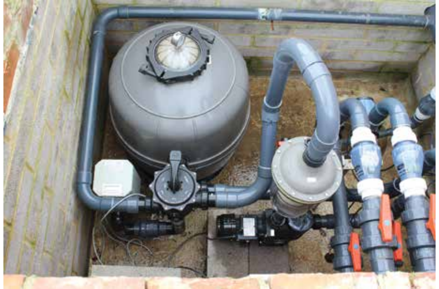
▲ Exotuf Pond Professional Bead filters are designed for ponds and water gardens. It provides mechanical and biological filtration in a compact single vessel.

This Waterco equipment works well in conjunction with the gravel bed filtration already built around the pool edges. This sort of filtration is also known as 'regeneration zone', and is an effective method through which natural pools are kept clean and free from threats from algae invasion.