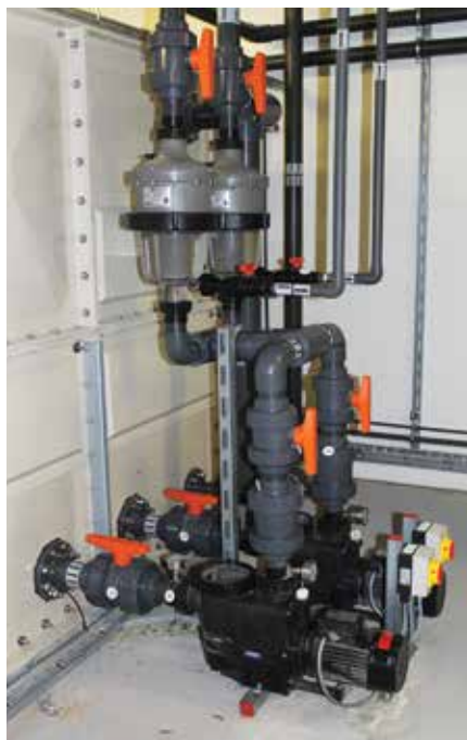
▲ The main filtration for the pedestal water clock feature is operated by a separate plantroom to the communal courtyard feature. Water is drawn from a holding tank and comprises of 2 x Micron SMDD900 commercial filters complete with 3" MPV's and 2 x Hydrostorm Plus 3HP commercial pumps that are plumbed in conjunction with 2 x MC16 multicyclones for sediment removal. Also 2 x Hydrostar 7HP commercial pumps are installed for the overflow effect and circulation.

Two additional pumps - 1 x 5HP Hydrostar and 1 x 3HP Hydrostar - are installed for the water column feature and the water wall, rill and wishing well.