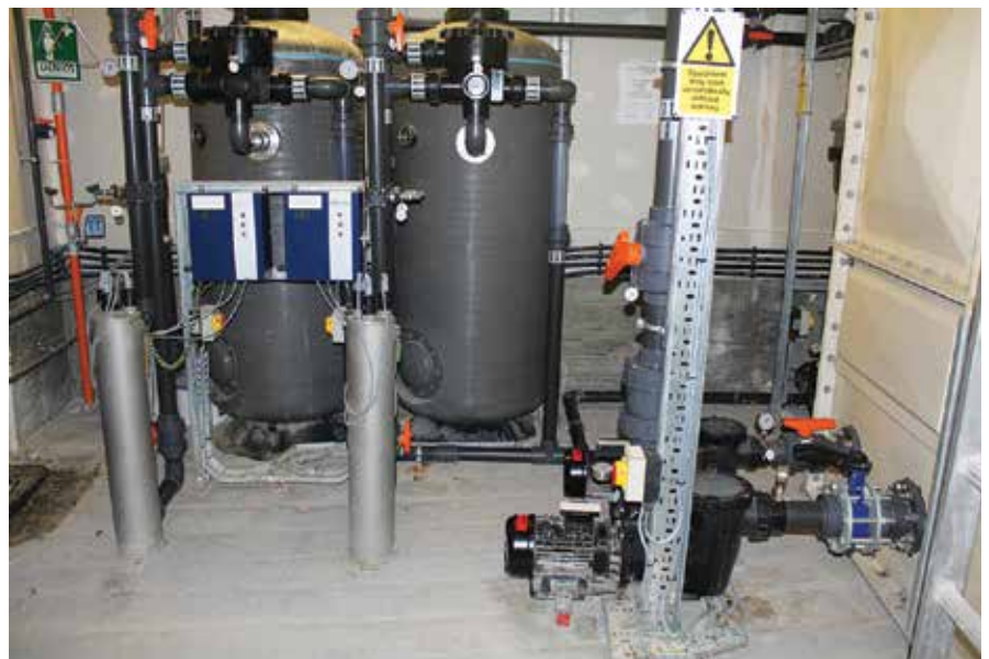
The main filtration for the communal courtyard features comprises of 2 x Micron SMDD750 commercial filters complete with 3" MPV's along 2 x Hydrostorm Plus 3 HP pumps that are plumbed in conjunction with 2 x MC16 multicyclones for sediment removal. In addition 2 x Hydrostar pumps are installed for the water column, crystal water wall, rill and "wishing well".