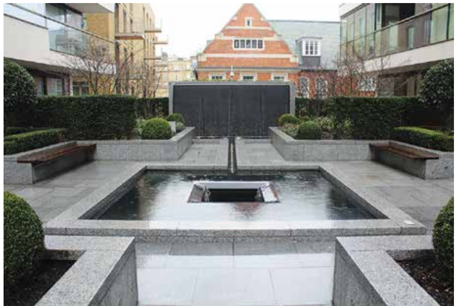
The "podium garden" located between blocks three and four of the development, features a communal court yard encompassing an impressive crystal water wall, rill and "wishing well".

"When we were asked to be involved in such a fantastic project we were more than delighted," says Waterco Europe CEO, Tony Fisher. "Appreciating how the water features were such an important part of the development, and having the opportunity to work with Fountains Direct once again on such an impressive project, was a no-brainer."