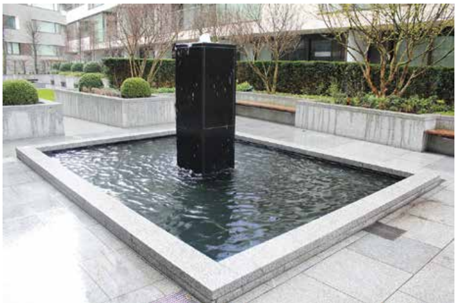
There are 5 water features in total with in the communal court yard and the public realm, including a 4.75 m tall water column.

As Tony explains, there are five water features in total in the Communal Gardens and within the public realm. Sitting within the Communal Garden as well a 'wishing well' including a rill and crystal water wall feature is a multi-jet fountain area and water